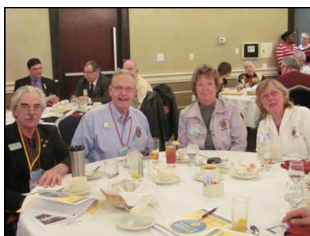
← Rochester Lions Club members at the Michigan Lions Forum in Lansing.